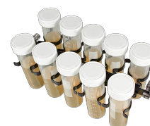
PRSC-10 BS-010117-LK platform

Can accommodate 22 tubes 16 mm diameter (15 ml).