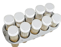
PRS-10 BS-010117-IK platform

5 tubes 20–30 mm diameter (50 ml tubes) and 12 tubes 10–16 mm diameter (1.5–15 ml tubes).