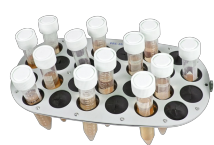
PRS-26 BS-010117-GK platform

Can accommodate 26 tubes 10–16 mm diameter (1.5–15 ml).