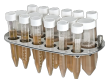
PRS-5/12 BS-010117-HK platform

Can accommodate 26 tubes 10–16 mm diameter (1.5–15 ml).