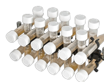
PRSC-22 BS-010117-LK platform

10 tubes 20–30 mm diameter (up to 50 ml tubes).